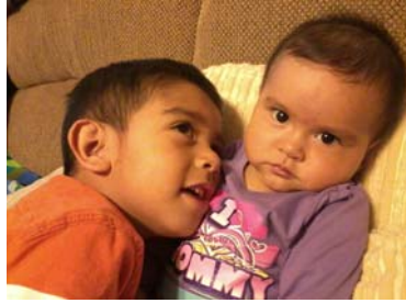
Laurent Clerc National Deaf Education Center

Family members are a baby's greatest resource. They know the baby best and spend the most time with the baby. The baby gets food, shelter, love, and communication from family members. It is this last part, communication that sets deaf and hard of hearing babies apart from other babies.